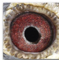
- Zonensieger -